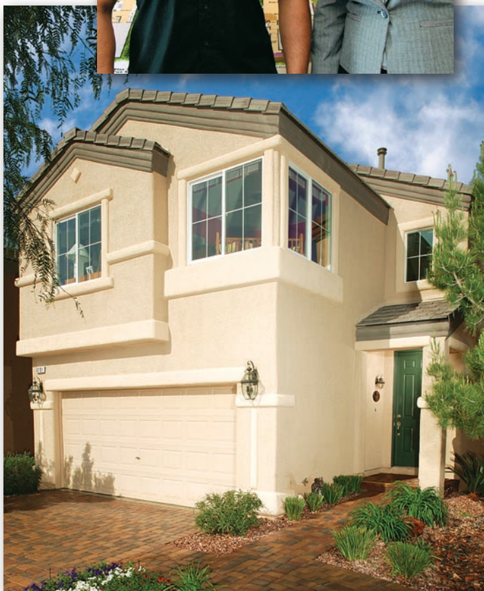
Ricardo Canilao bought Distinctive Homes' Plan 1559, a two-story home with three bedrooms, 2 1/2 bathrooms, tech loft and two-car garage.

include Low-E windows, 13 SEER air conditioners and 50-gallon water heaters.