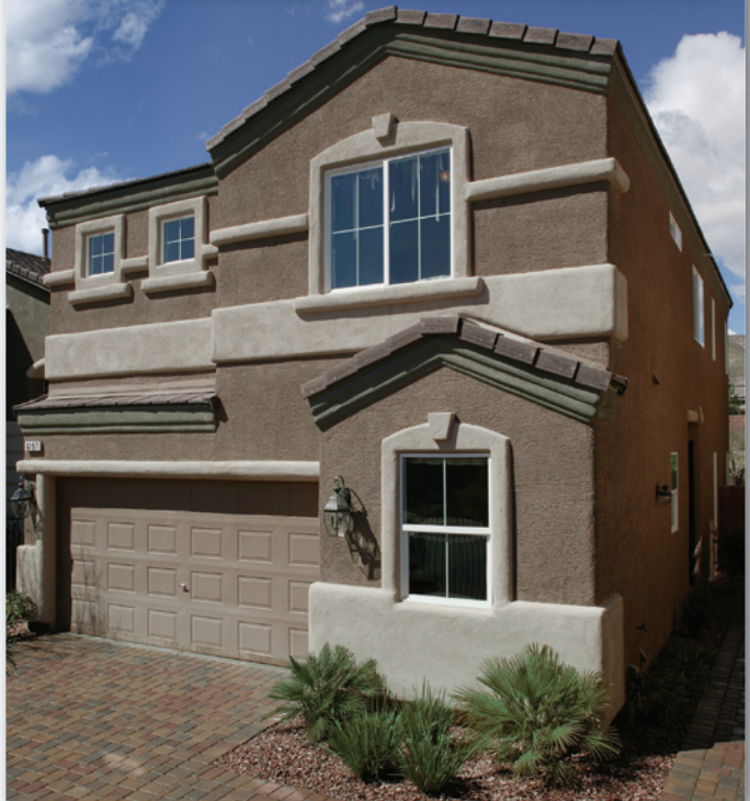
Kyoung and Terry Namgung and their two children have room to roam in Plan 1835 at Springs Ranch, a two-story home with three bedrooms, 2 1/2 baths and a loft selling from the low $300,000s.

include oversized Low-E windows; 13 SEER air conditioners and 50-gallon hot water heaters.